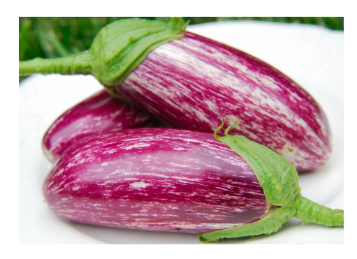
Listada de Gandia