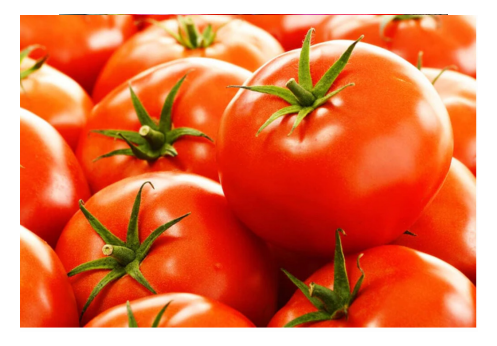
Box Car Willie

Plants are productive. Fruits are red, 6-18 oz. each, with firm flesh that has a slightly sweet, berry-like flavor and a tart aftertaste. Resistant to sunburn, spots and cracking.