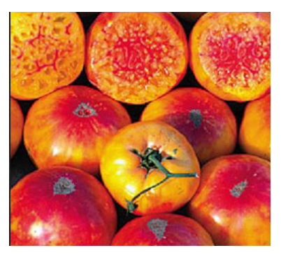
Hillbilly (Potato Leaf)