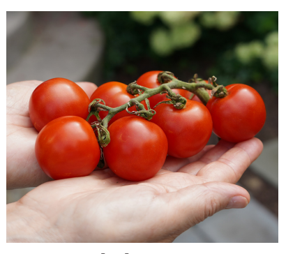
Large Red Cherry