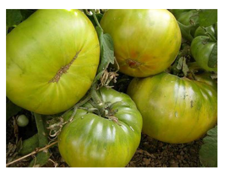
Aunt Ruby's German Green