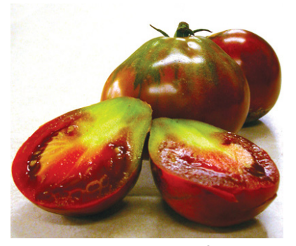
Japanese Black Trifele