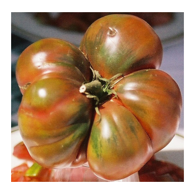
Black from Tula