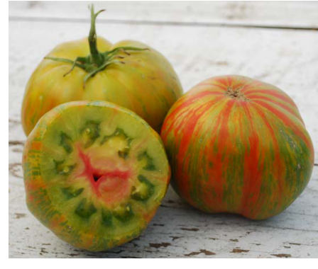
Berkeley Tie Dye Green